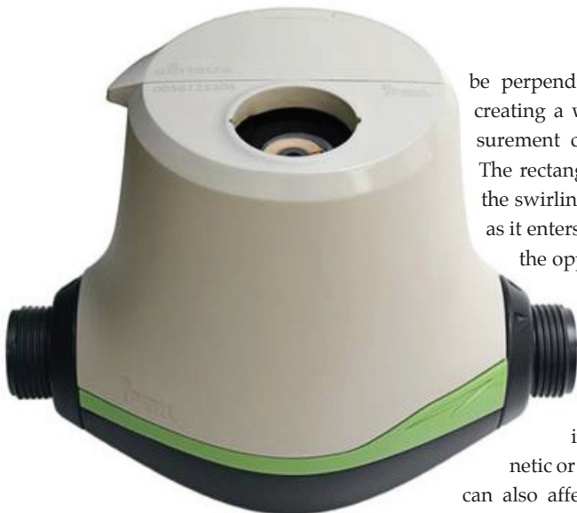
A breakthrough in water meter technology delivers unprecedented efficiency through low flow accuracy and high flow durability.

detection of leaks, which is important for both the consumer and the utility.